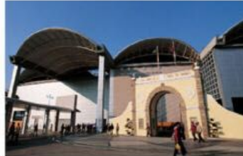
威尼斯人免费穿梭巴士